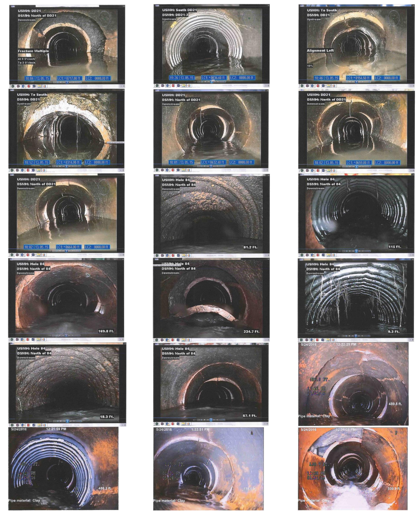
McClellan moved, Granzow seconded to approve for Ryken Engineering to produce Engineer's Reports that includes repairing the tile, replacing the tile and for improving the capacity of the tile. It was discussed that in the meantime, all needed repairs should be temporarily repaired and not left open. All ayes. Motion carried.

McClellan moved, Granzow seconded to adjourn the meeting. All ayes. Motion carried.